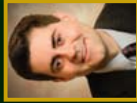
Dr. Russell Moore , Senior Vice President for Academic Administration, Dean of the School of Theology, and Executive Director of the Carl F. H. Henry Institute for Evangelical Engagement at the Southern Baptist Theological Seminary